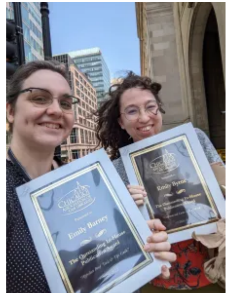
Making the award exchange!

Fortunately we work near each other, so we arranged for a quick street-corner exchange next to Union Station before the May 2022 Business meeting began!